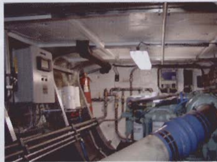
Power comes from twin Detroit diesels

Email: mhotchkiss@allamericanmarine.com, Web: www.allamericanmarine.com or Teknicraft Design, New Zealand. Email: info@teknicraft.com, Web: www.teknicraft.com