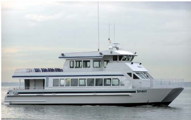
The 'Spirit' is designed for the Alaska eco-tour business.