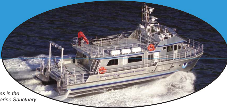
The R/V Shearwater operates in the Channel Islands National Marine Sanctuary.