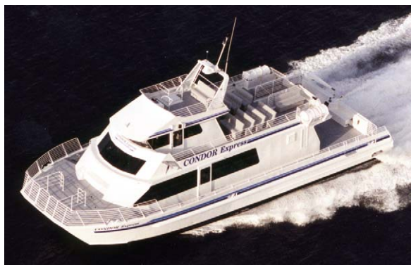
The Condor Express operates in the Channel Islands Marine Sanctuary, CA.